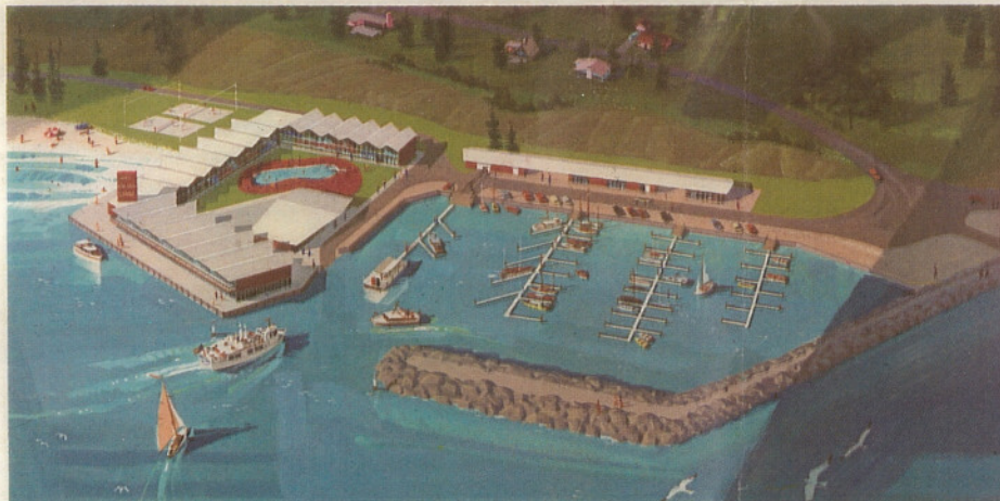
Completed development will feature a modern marina, boater and theatre restaurant.